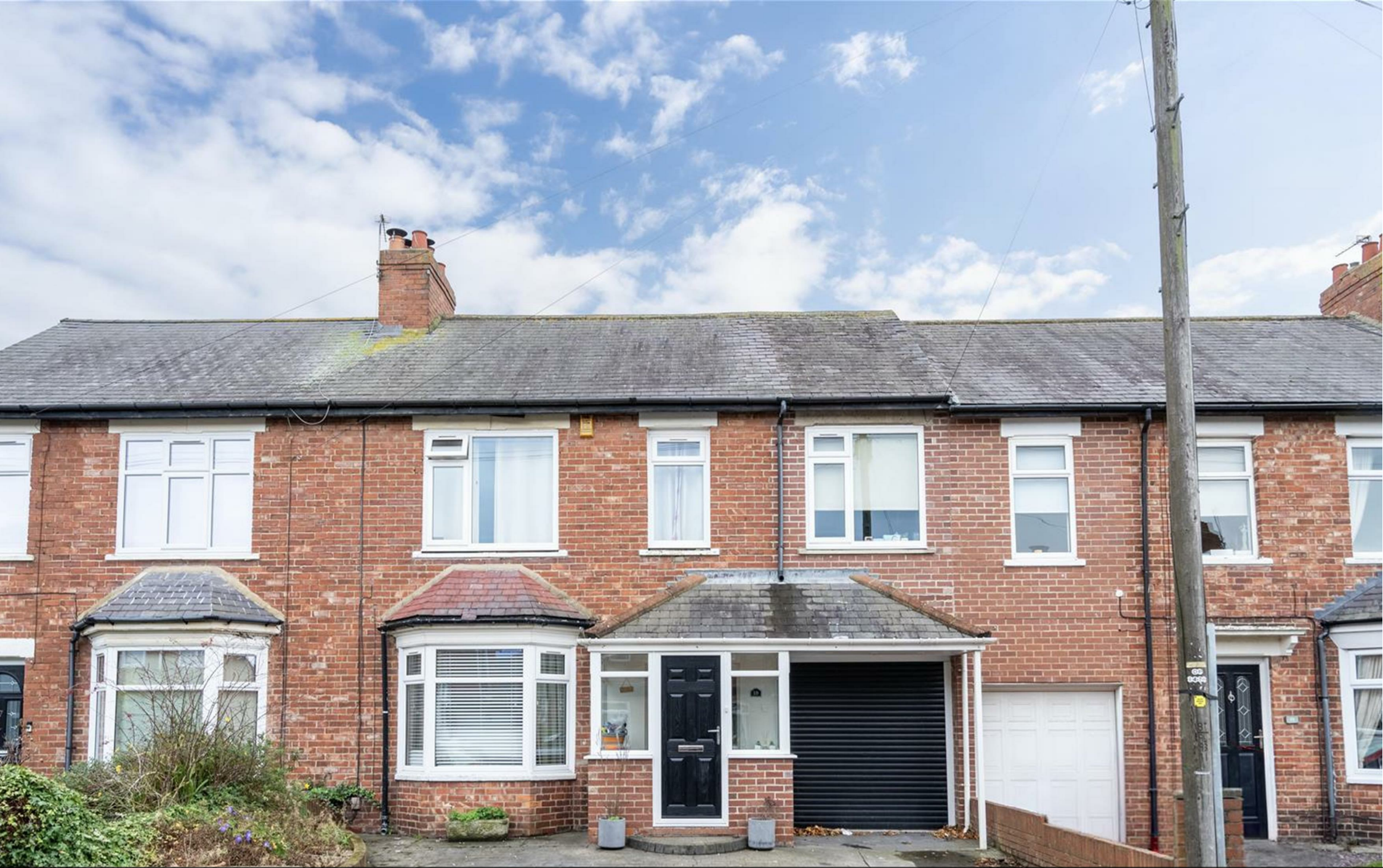
📍 Tarset Road, Whitley Bay NE25 9HN